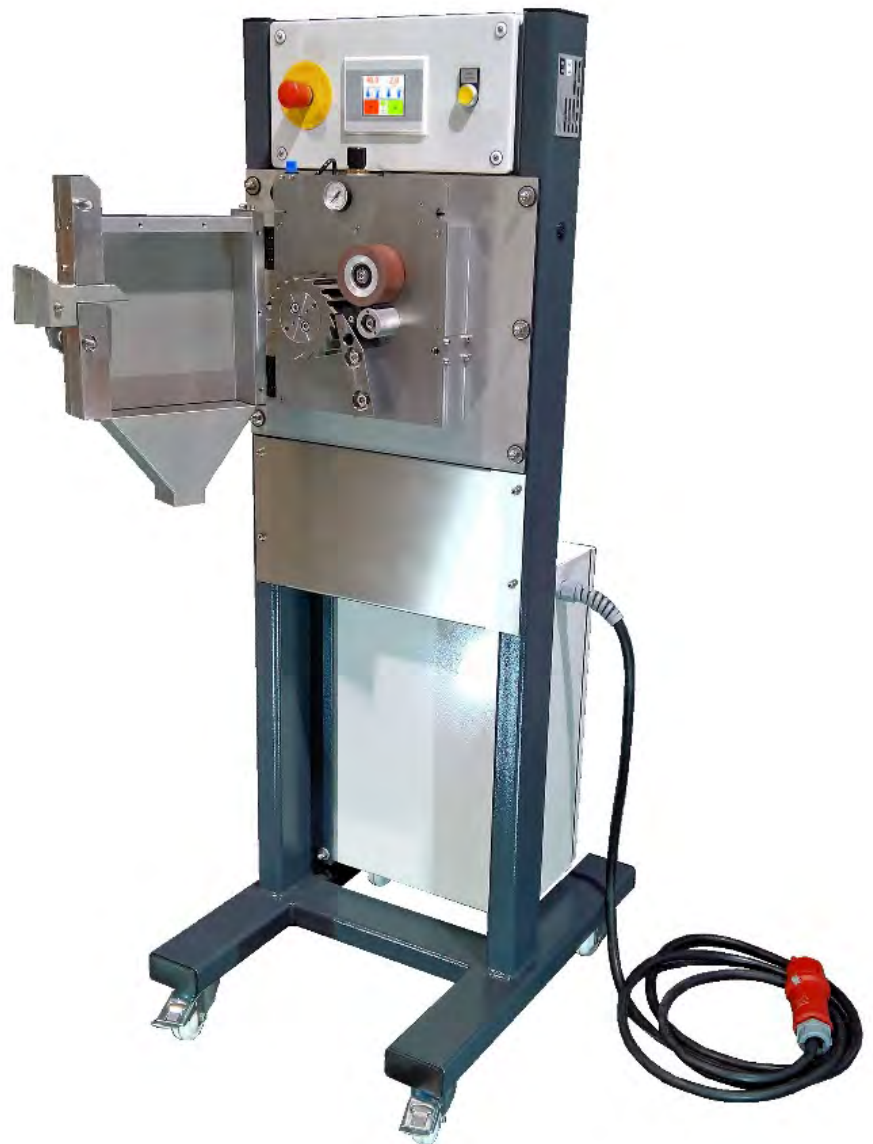
Pelletizer PT-G50E - duodrive