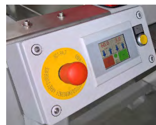
Operating panel, with Touch-Display (optional)

The pelletizer PT-GxxxD series are thus optimally equipped for the continuous production of filled and reinforced compounds or masterbatches from a wide variety of products.